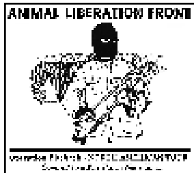
Operation Biteback Green, Red, or Beige

All shirts are available in sizes Med., Lrg., and X-Lrg. $13