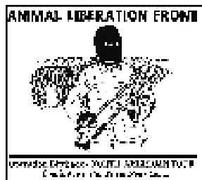
Operation Biteback Green, Red, or Beige

All shirts are available in sizes Med., Lrg., and X-Lrg. $13