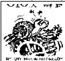
Viva ELF Beige only