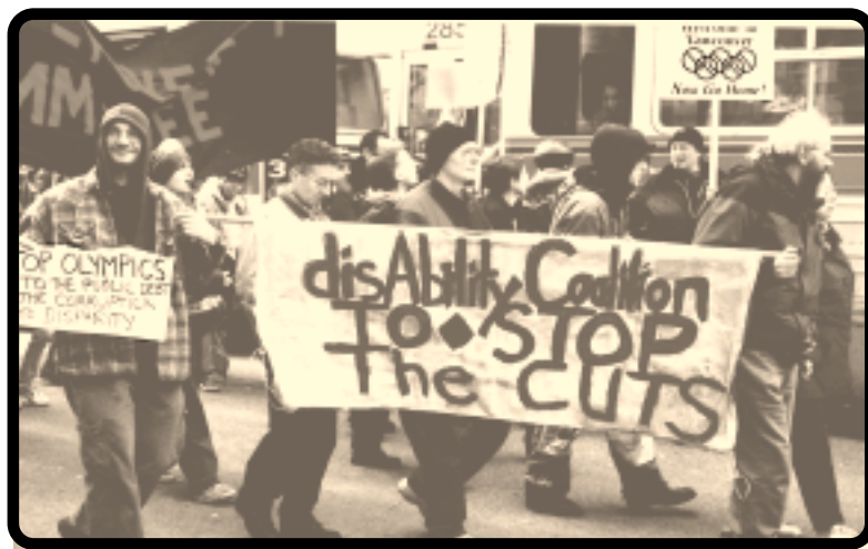
March 5th, 2003, The Disability Coalition at the Anti-Olympics March

*obliterate - to destroy or remove all traces