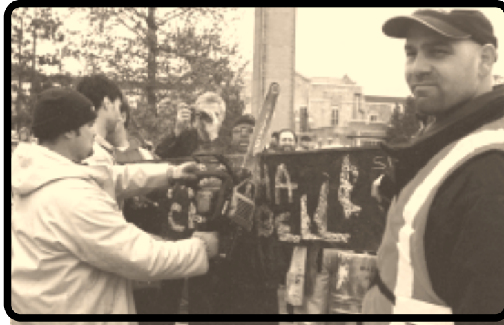
March 14th, 2003, UBC CUPE members cutting up a coffin representing the death of democracy after the Liberals passed legislation taking away their right to strike.