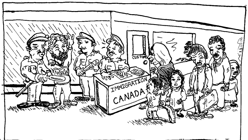
WELCOME TO CANADA ...