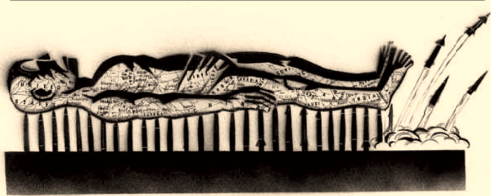
- Illustration by Peter Kuper

APC is committed to fighting the brutal policies of the BC Liberals through direct action, mass mobilization, and casework. We oppose racism, sexism, homophobia, and all other forms of oppression. APC is an independent and democratic organization open to anyone who agrees with our basis of unity. We are committed to working in solidarity with the struggles of other progressive movements—locally, nationally, and internationally—to end poverty and injustice.